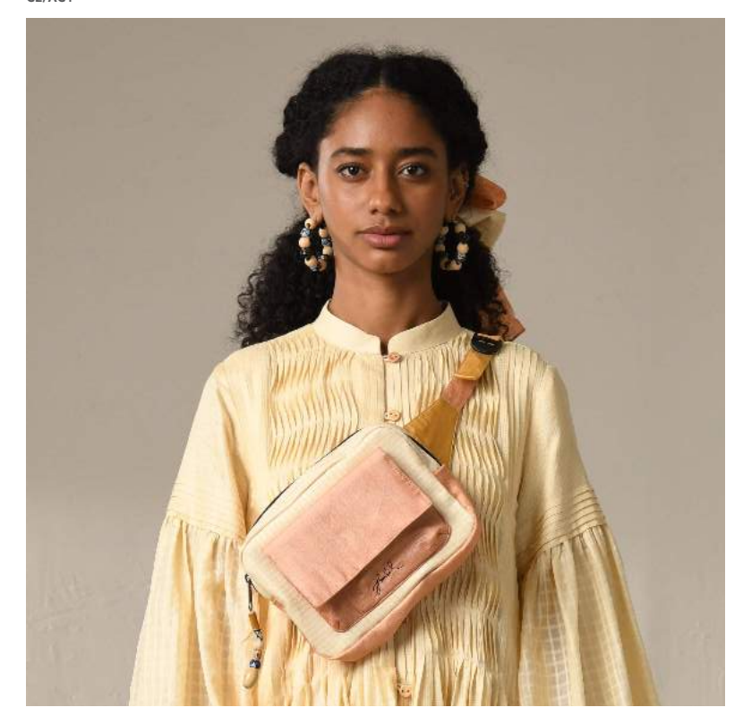
CELADON belt bag -