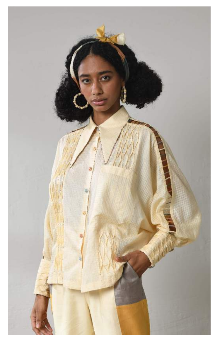
YUNOMI blouse -