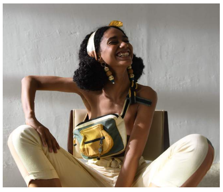
BALL CLAY belt bag