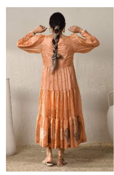
FLAMBÉ DUSK —