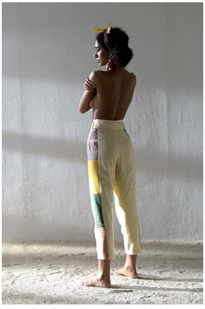
PYXIS trousers -